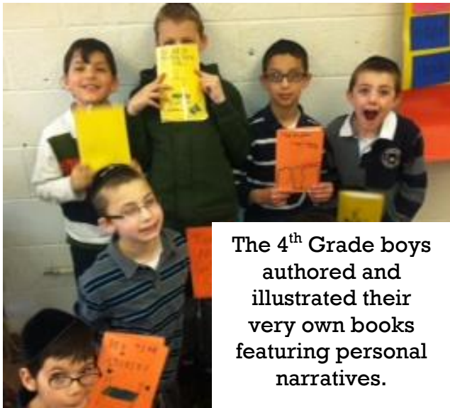
The 4 th Grade boys authored and illustrated their very own books featuring personal narratives.