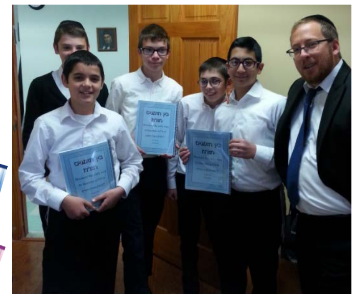
The 7th Grade boys completed their חזרה of מסכת מסכת over .